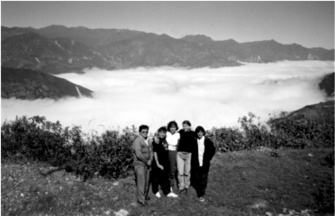
DIVERSITY OF SKILLS: Facilitators in Peru's project included a range of professionals – an obstetrician, a nurse, a psychologist, an anthropologist and a community planner – pictured here on their way to a community meeting in Choropampa.

the marginalization typical to the Andean region, which is reflected in the manner by which women are omitted from decision-making in the community.